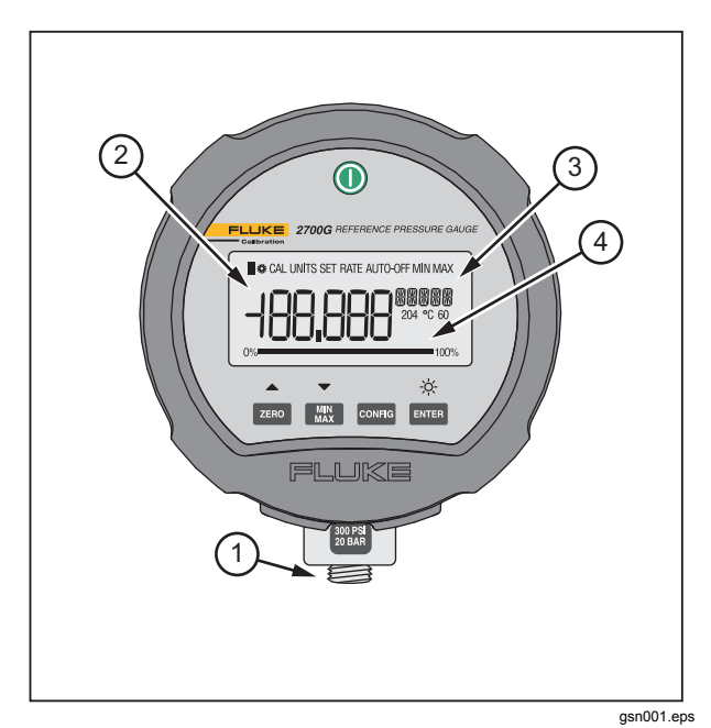
Figure 1. The Product

The Display and Buttons are shown in Figure 1. The Buttons are in Table 2.